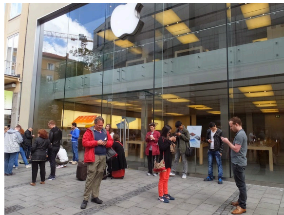
Members of the public leeching off of Apple's free Wi-Fi outside one of their stores.

This is important, if you don't have a secured password on your home network you open yourself up to people leeching your connection, or, worse, using it for illegal purposes for which you might get the blame! Most routers come with the wifi connection already secured with a default password, but if your doesn't just follow the manual to make sure you turn it on and set a secure password.