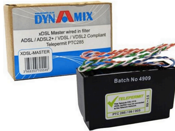
A master filter