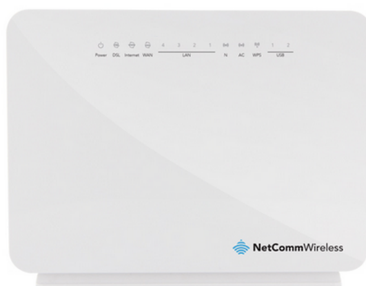
The Netcomm NF8AC router

especially if you have lot of devices accessing the net at the same time. You wouldn't buy a new 64" LED TV and place it onto an old, wonky and unsuitable TV stand, so why have broadband and use a really cheap router? Ensuring that you have a decent router with updated firmware will optimise your Bigpipe broadband experience. The expected lifespan of a cheap router is 1-3 years whereas if you invest a little more, you can expect your router to last you 5+ years. Bigpipe recommends the Netcomm NF8AC as this router is suitable for all broadband plans including UFB all the way up to 1Gb speeds, so you're really investing yourself in the broadband of the future.