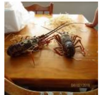
Thats just cray- zy