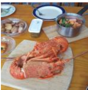
Delicious dead underwater scorpion things